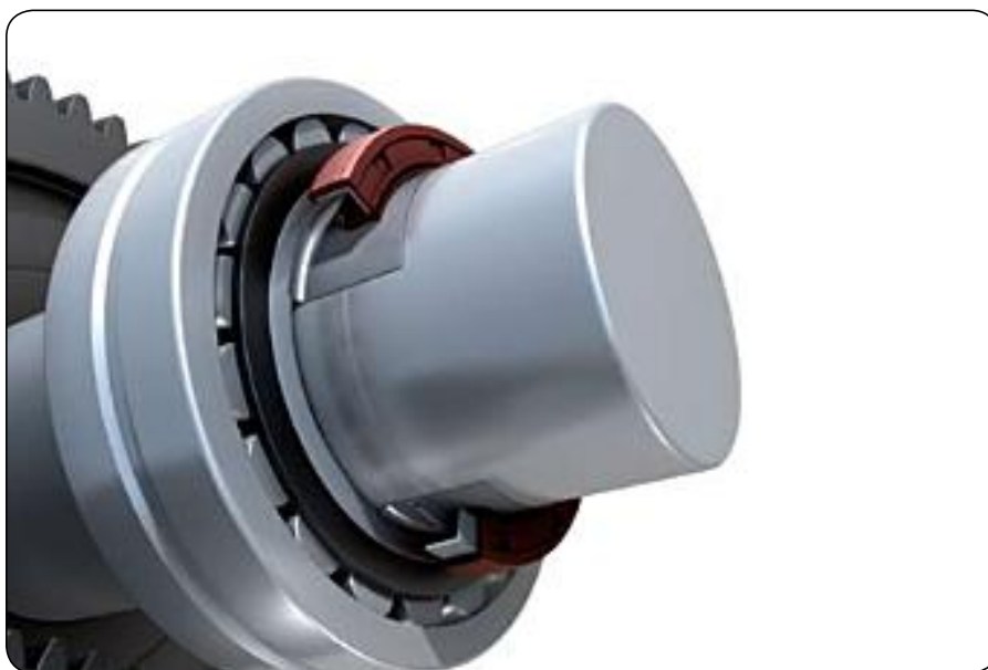
SKF SPEEDI-SLEEVE new generation + SKF radial shaft seal