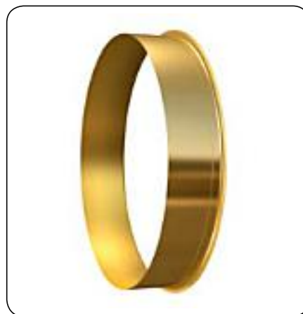
SKF SPEEDI-SLEEVE new generation, Gold version